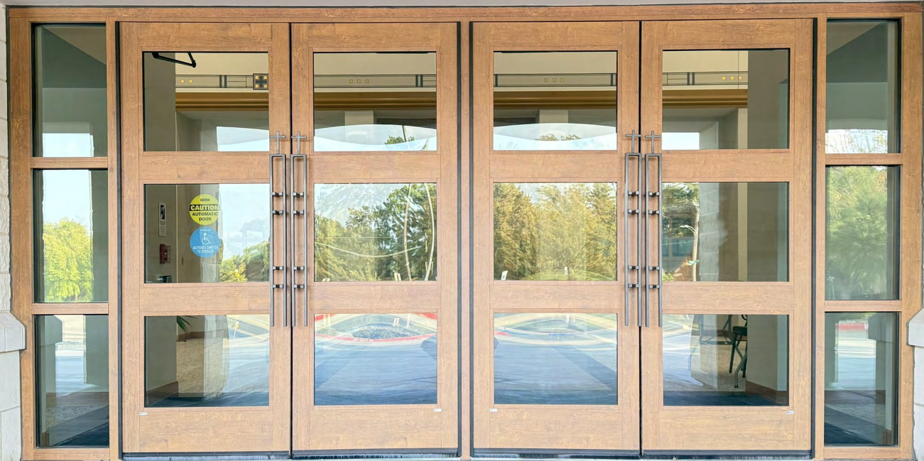
St. Thomas More Catholic Church Manhattan, KS

Manko's thermal "i" series entrance doors are ideal for projects seeking a thermally efficient solution. These doors are 2 1/8" thick, and come in two stile widths; 3 1/2" medium stile ( 135i series ) and 5" wide stile ( 150i series ). Both doors come standard with 10" bottom rail, however additional sizes are available.