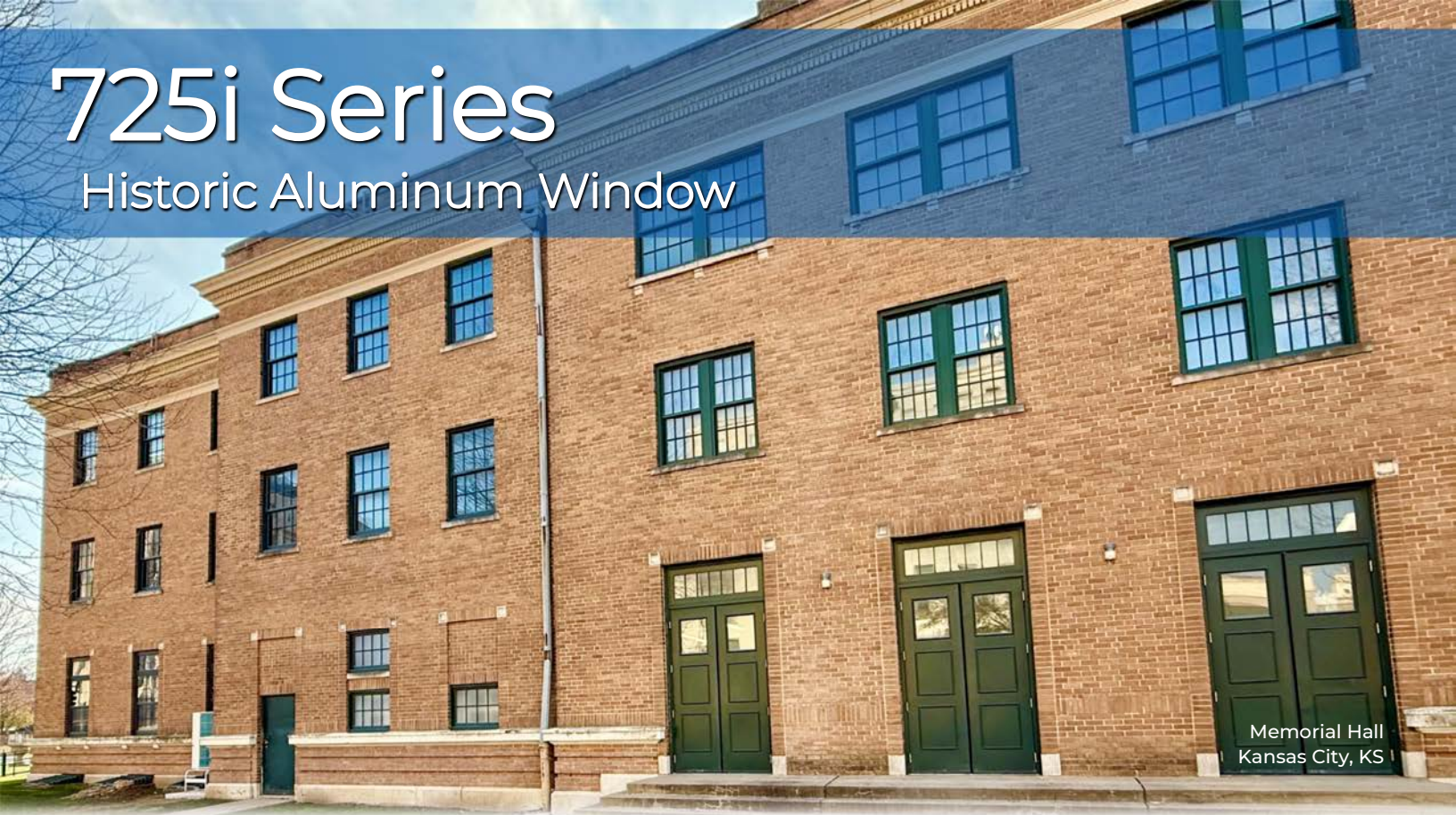
Memorial Hall Kansas City, KS

The redesigned 725i series window was developed with historic window profile consideration in mind, and is available as either a true single hung or fixed simulated hung. The single hung and fixed options offer matching sightlines, allowing these two options to be seamlessly integrated. With a 4 1/2" overall frame depth, this window uses a polyamide thermal strut to provide an efficient, yet structurally sound window. For unique restoration projects, custom profiles may be available if needed to better match your projects' existing windows.