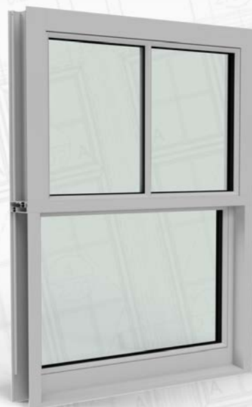
725i Fixed Simulated Hung