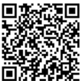
Central School Guthrie, OK

Visit www.mankowindowsystems.com Or scan the QR code for more information on Manko's 725i Series Historic Window