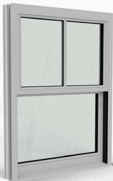
725i Single Hung

The redesigned 725i series window was developed with historic window profile consideration in mind, and is available as either a true single hung or fixed simulated hung. The single hung and fixed options offer matching sightlines, allowing these two options to be seamlessly integrated. With a 4 1/2" overall frame depth, this window uses a polyamide thermal strut to provide an efficient, yet structurally sound window. For unique restoration projects, custom profiles may be available if needed to better match your projects' existing windows.