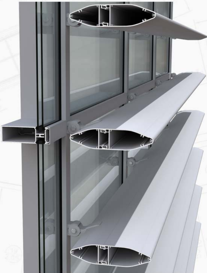
Curtain Wall Installation (12" Blade, Horizontal Orientation)

Kansas State University Engineering Building Manhattan, KS